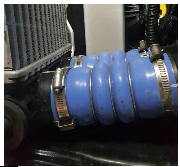
Removing BOV Chamber from Plumb back Hose

Undo the bolts securing the bracket to the cross member from the vehicle as well as the intercooler.